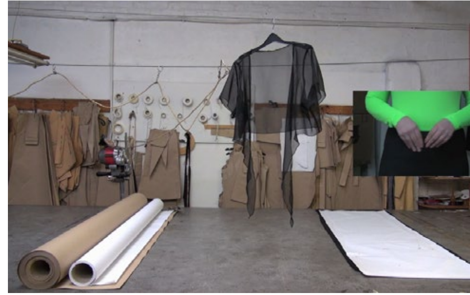
Lucy Clout Shrugging Offing (2013)